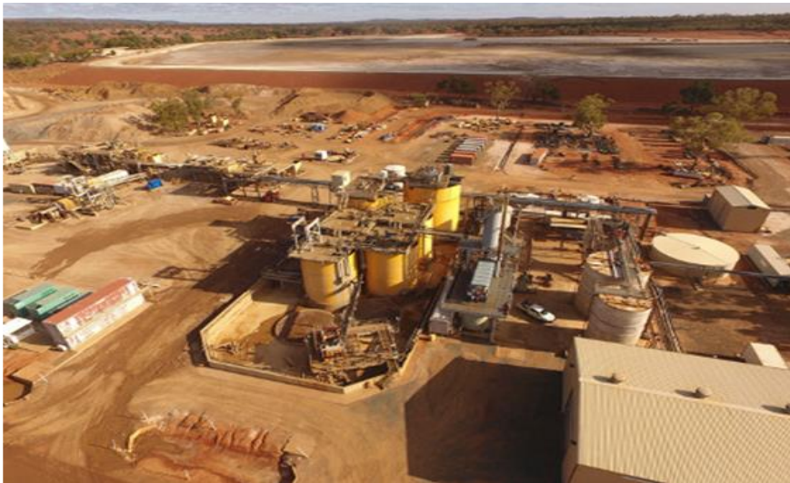
Wonawinta Silver Mine