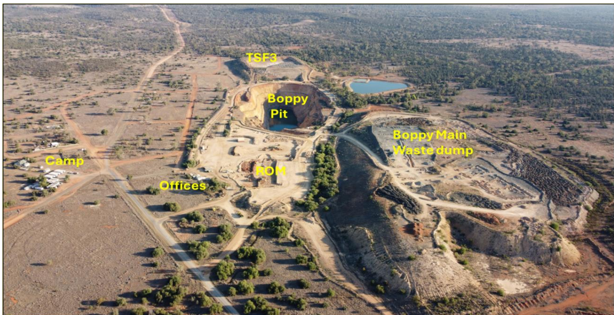
Figure 1: Drone image looking south showing the main components of the Rock Dump and Tailings Resources in relation to the Mt Boppy open pit.

Operations at Mt Boppy and Wonawinta continued in a state of care and maintenance, which had initially been introduced during the March 2024 quarter. Production at Mt Boppy is contingent on a portion of project finance being secured as part of a refinance of the senior debt which is underway. This is progressing. Commencement of Mt Boppy production has been delayed a little due to the refinance and now likely to commence in Q2 2025. Silver production at Wonawinta will follow subject to market conditions.