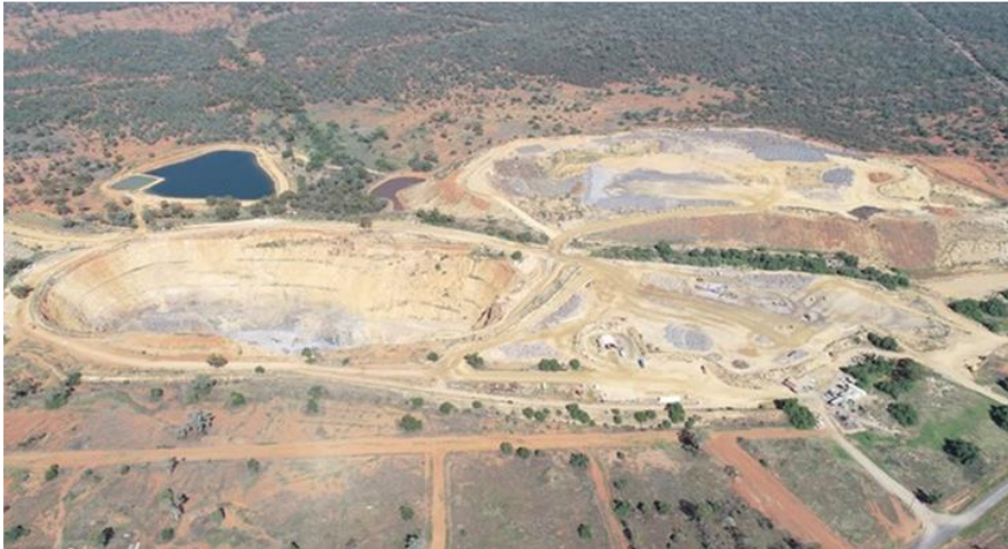
Mt Boppy Gold mine

The Company has to date processed its ROM stockpiles product through the Wonawinta metallurgical plant. Manuka are currently pursuing a strategy of establishing a fit-for-purpose, on-site crush-screen-mill-float/leach-facility to enhance the economics of the Mt. Boppy Mine and the value of near-mine prospects. The Mt Boppy site includes a 48-person mine camp and is fully permitted for the proposed processing plant and on-site production.