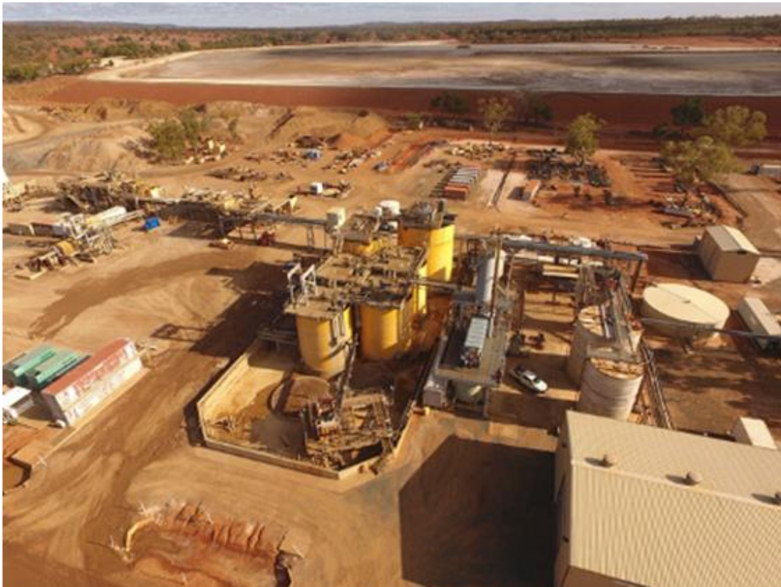
Wonawinta Silver Mine

The Wonawinta processing plant has a nameplate capacity of approximately 850,000tpa. The Company is reviewing the potential of recommencing operations at Wonawinta, taking advantage of the strengthening silver price environment.