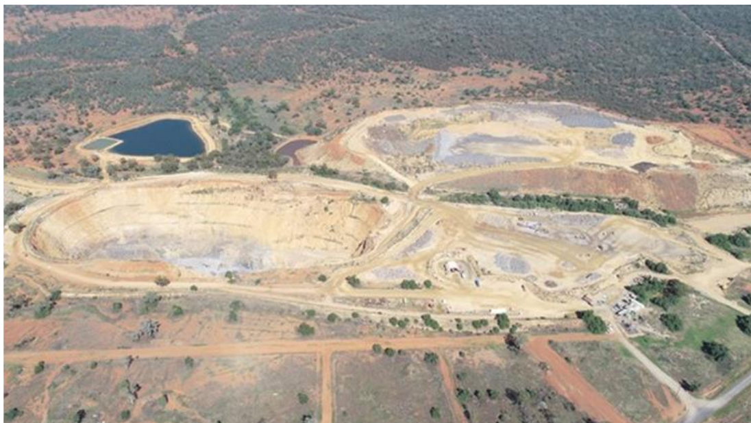
Mt Boppy Gold mine

The Company has to date processed its stockpiles and gold mineralised waste product through its Wonawinta plant. The Mt Boppy site includes a 48-person mine camp and exploration potential in neighbouring tenements. Manuka awaits the outcome of its forthcoming exploration program to determine whether potential future mining of Mt Boppy extensions will be as an underground or open cut mine and is also assessing the economic merits of locating a plant at Mt Boppy.