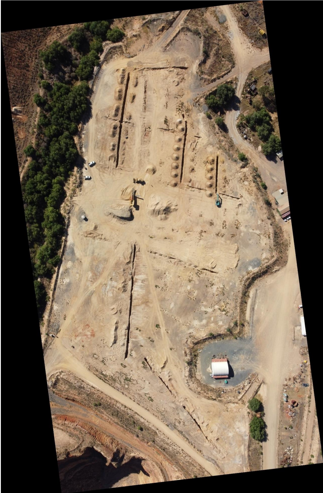
Figure 1: Drone view of Trench evaluation of the Mt Boppy ROM rock dump and tailings